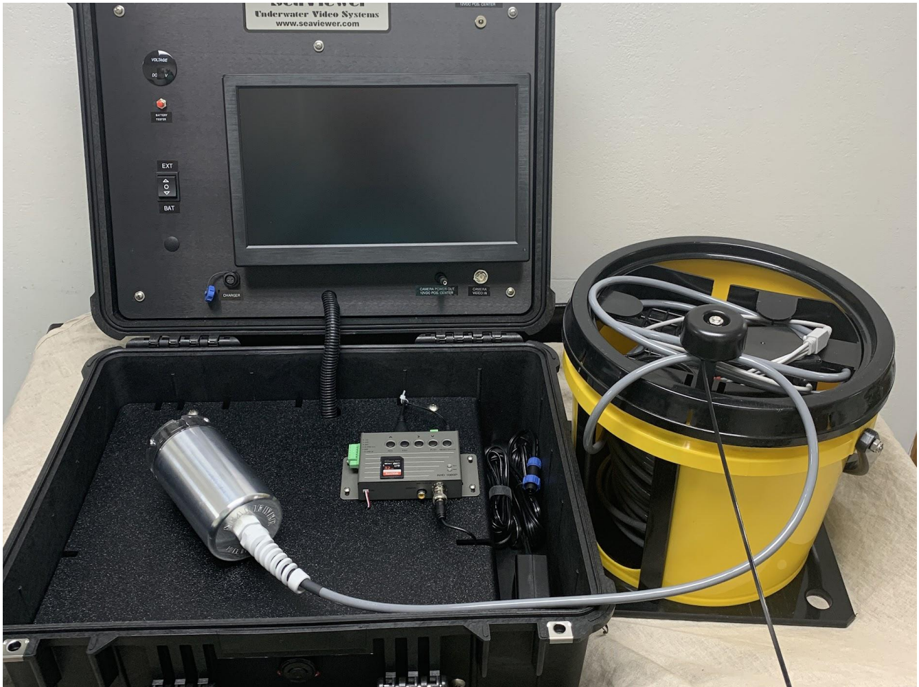
Typical connections / Shown with optional accessories